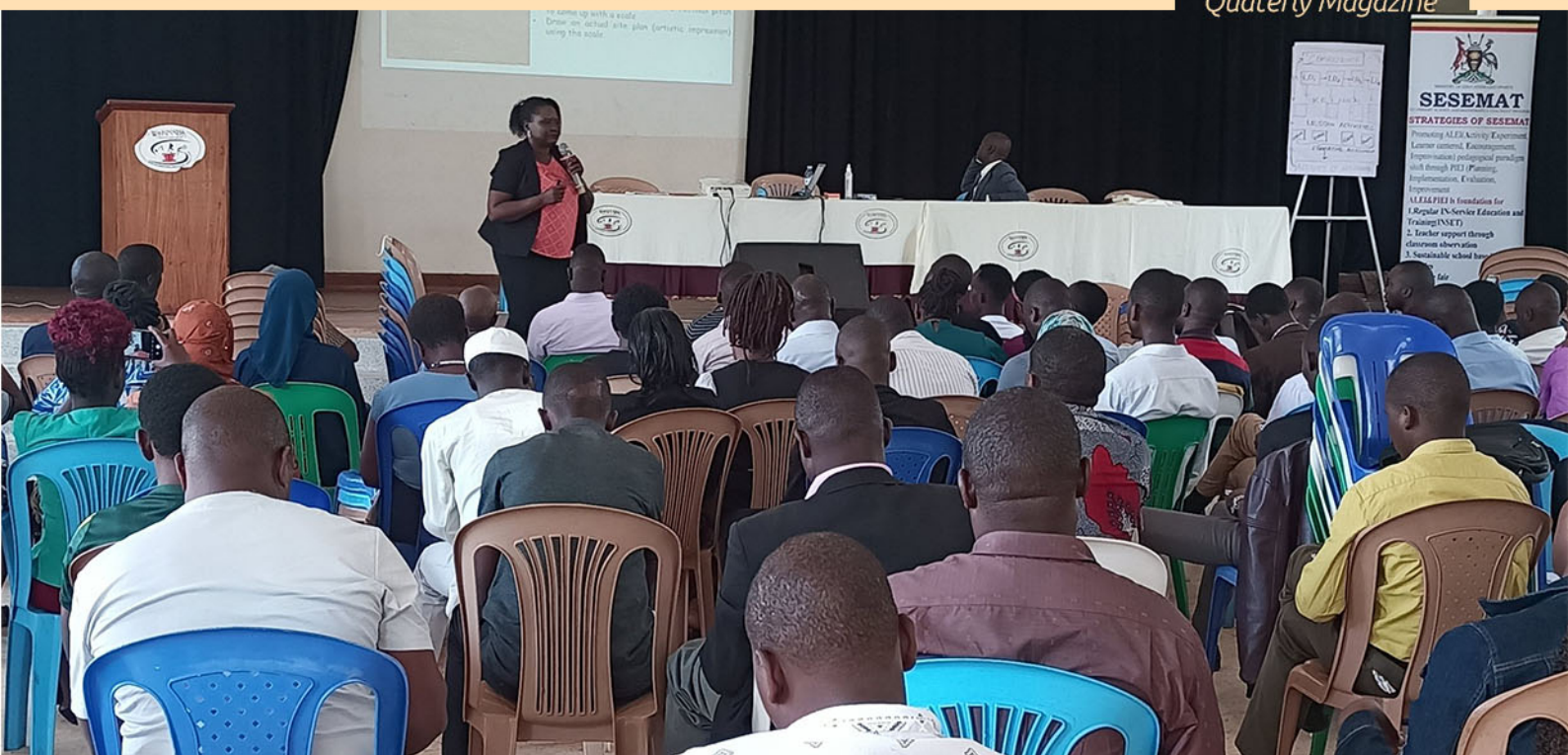
Teachers during a SESEMMAT training in Masaka

educational landscape, leaving no student behind.