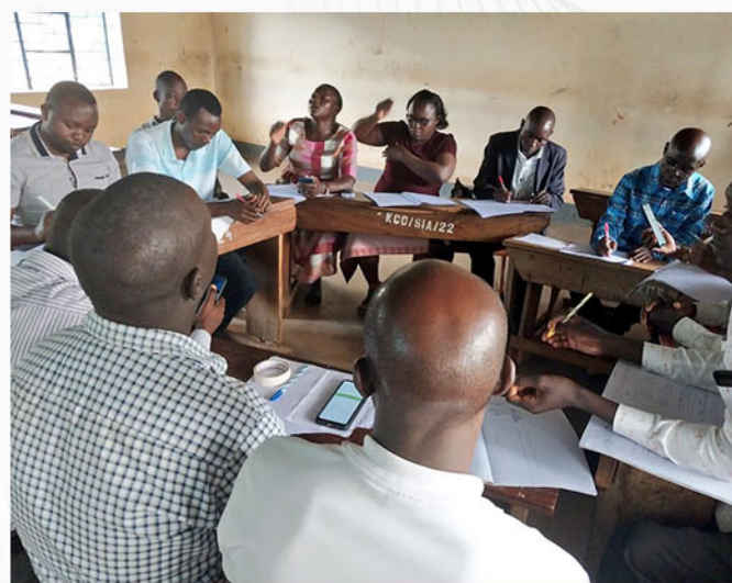
Teachers during SESEMMAT training in Masaka

schools. As the implementation progresses, the Ministry anticipates positive outcomes that will contribute to a more robust and competitive education system in the long run.