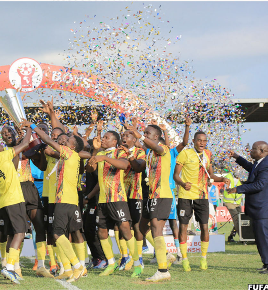
U18 Uganda Cranes Boys team lifting the CECEFA Cup in Kenya

Uganda's victory in the CECAFA U18 Boys Championship stands as a testament to their exceptional teamwork, unwavering spirit and remarkable talent. The players' prowess on the field, coupled with their resilience under pressure, captivated audiences and secured their place in the annals of Ugandan football history. As celebrations reverberate across the nation, Uganda proudly embraces these young champions, celebrating their hard-earned victory that brought glory to the country.