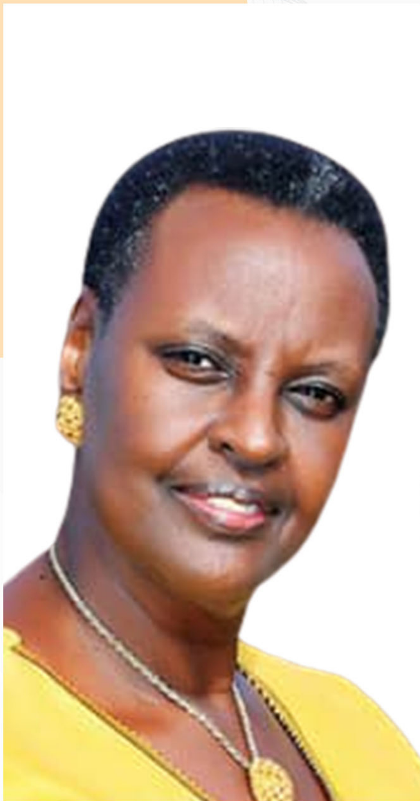
HON. JANET KATAAHA MUSEVENI

First Lady and Minister of Education and Sports