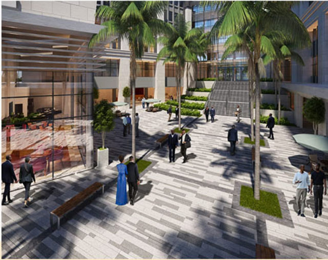
Artistic impressions of the newly commissioned headquarters.

Hon. Janet Kataaha Museveni, the Minister of Education and Sports, emphasised that the Ministry prioritised establishing its headquarters over the years and now it appears that the dream is within reach.