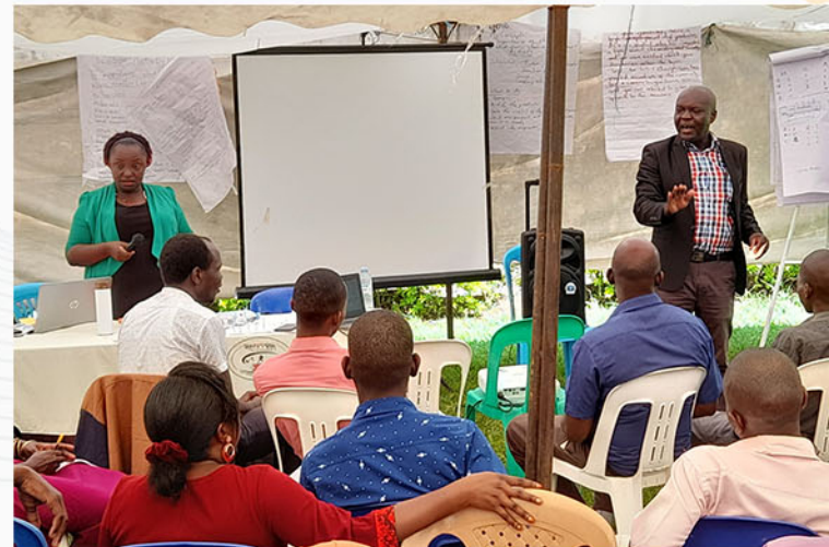
Teachers during SESEMAT training in Masaka

Teachers from various regions have undergone comprehensive training in key areas essential for the successful execution of the New Lower Secondary School Curriculum. These training sessions covered a spectrum of topics, including project work methodologies, content framework comprehension, test and assessment frameworks, as well as end-of-cycle setting. The goal is to equip educators with the necessary tools and knowledge to navigate the intricacies of the new lower secondary curriculum effectively.