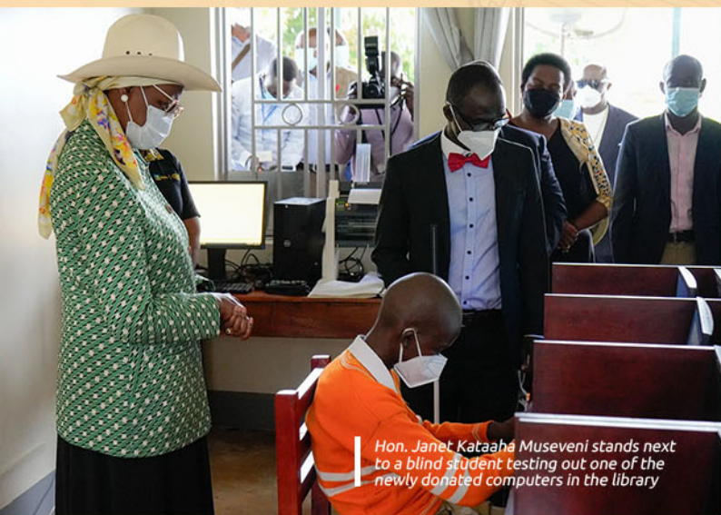
Hon. Janet Kataaha Museveni stands next to a blind student testing out one of the newly donated computers in the library

The newly constructed dormitory, built with a 70-bed capacity, is fully furnished with 40 beds and mattresses. The facility includes self-contained units and caretaker quarters, providing a comfortable and secure living space for 70 learners. Safety measures include state-of-the-art firefighting equipment, security cameras, and fire detection systems.