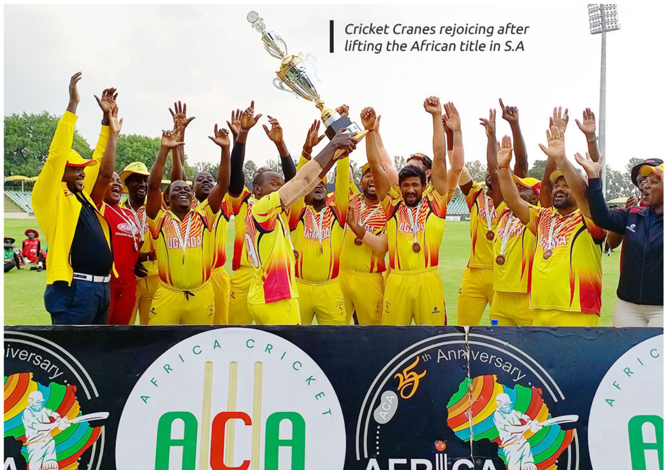
Cricket Cranes rejoicing after lifting the African title in S.A

Uganda's Senior Men's National Cricket team has carried the national flag to heights in both regional and international sports arenas and this time it was at the Cricket Africa in South Africa.