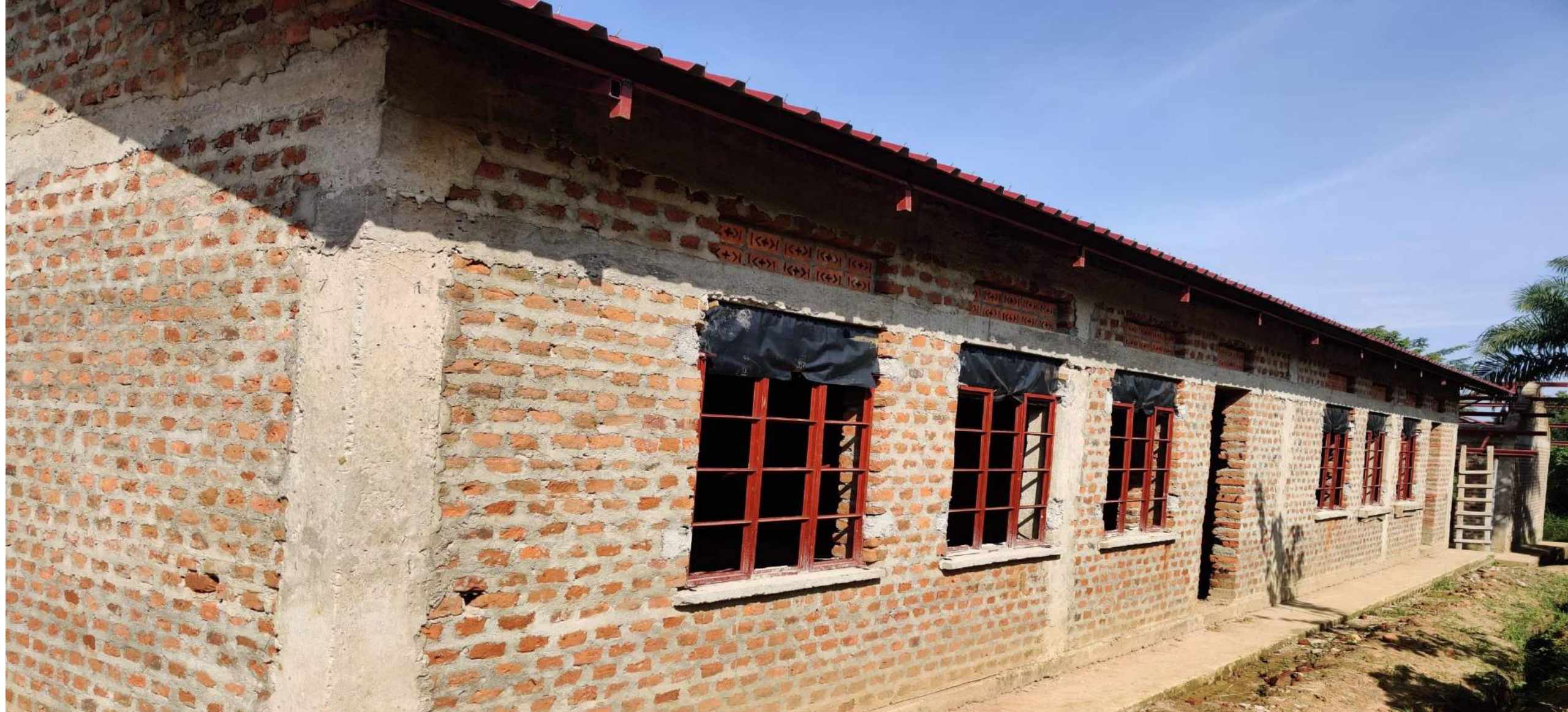
One of the 2-Classrooms Blocks built at Kisuba Seed School in Bundibugyo District – as part of the of 117 Seed Schools