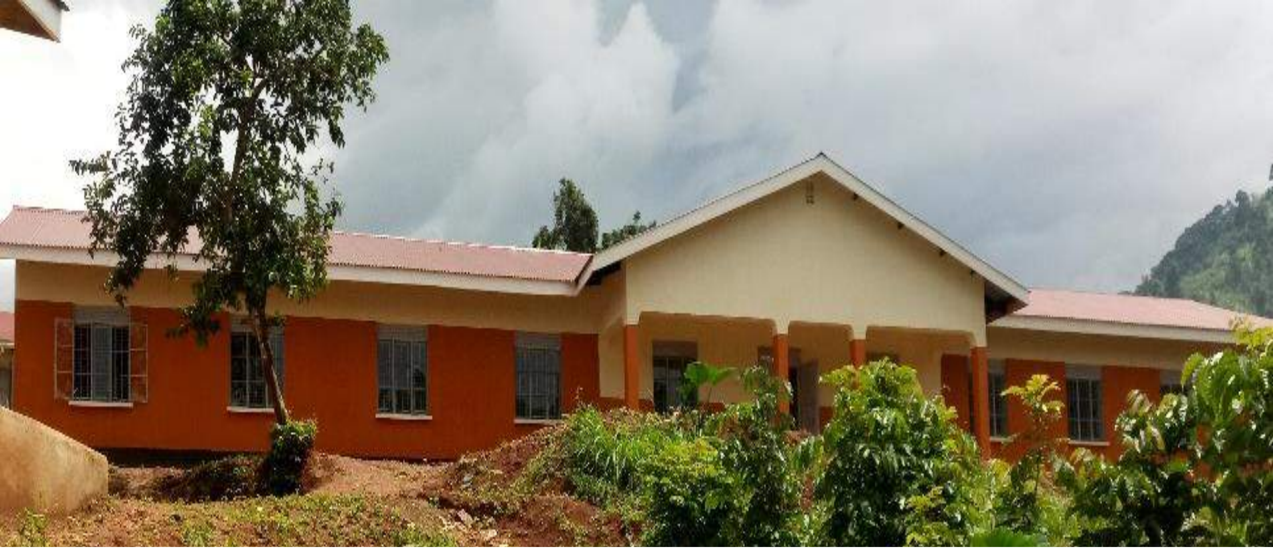
An ICT Laboratory Block constructed at Bubiita Seed School in Bududa – one of the 15 completed