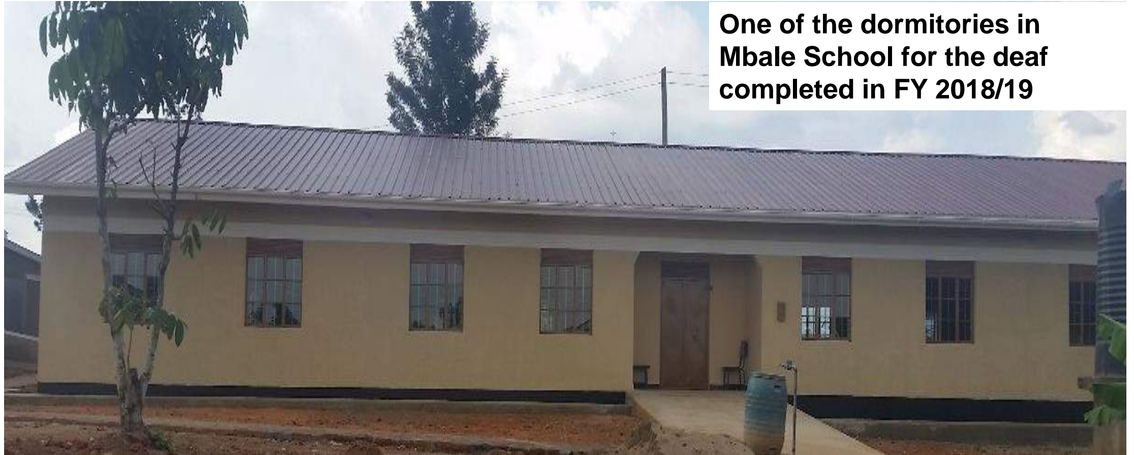
One of the dormitories in Mbale School for the deaf completed in FY 2018/19