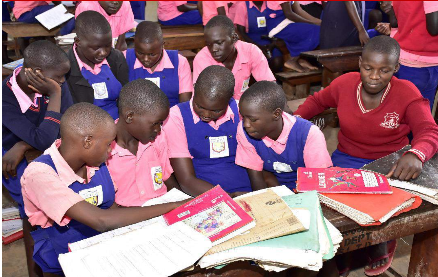
Photo : - Pupils doing group work in Amuca Primary School, Lira district.

Continuation of Commitment -5 : - As a result of government's interventions, the Textbook-to-Pupil ratio has improved from 14 pupils sharing 1 textbook to a textbook for 5 learners.