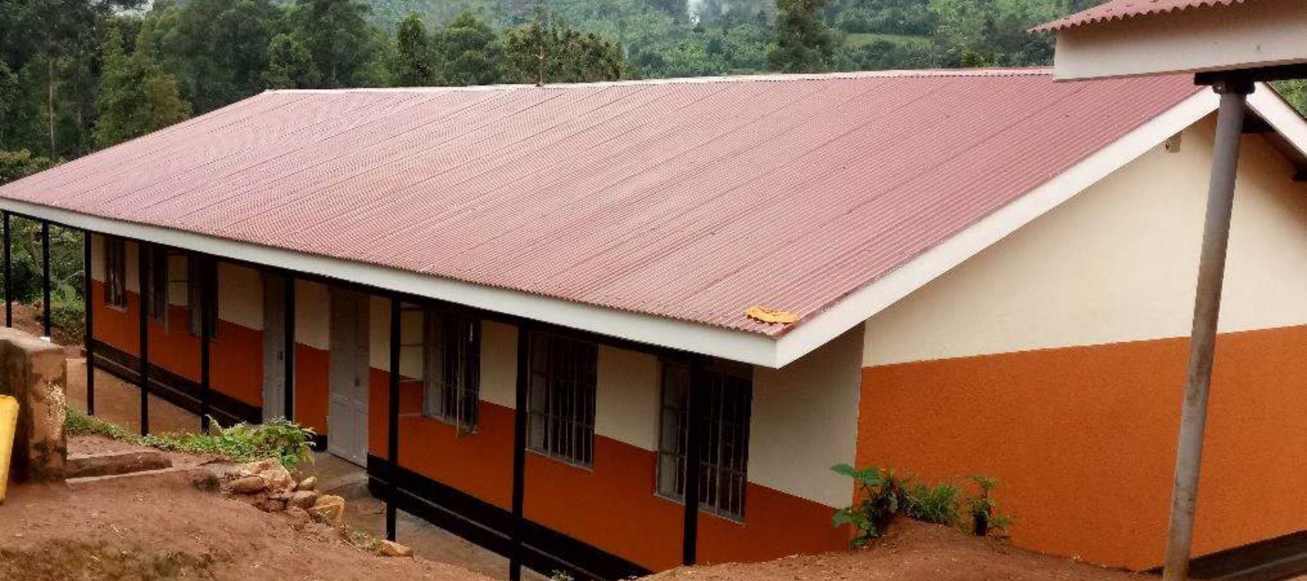
A Two 2-Classroom Block constructed at Bubiita Seed Secondary School in Bududa – part of the 15 completed