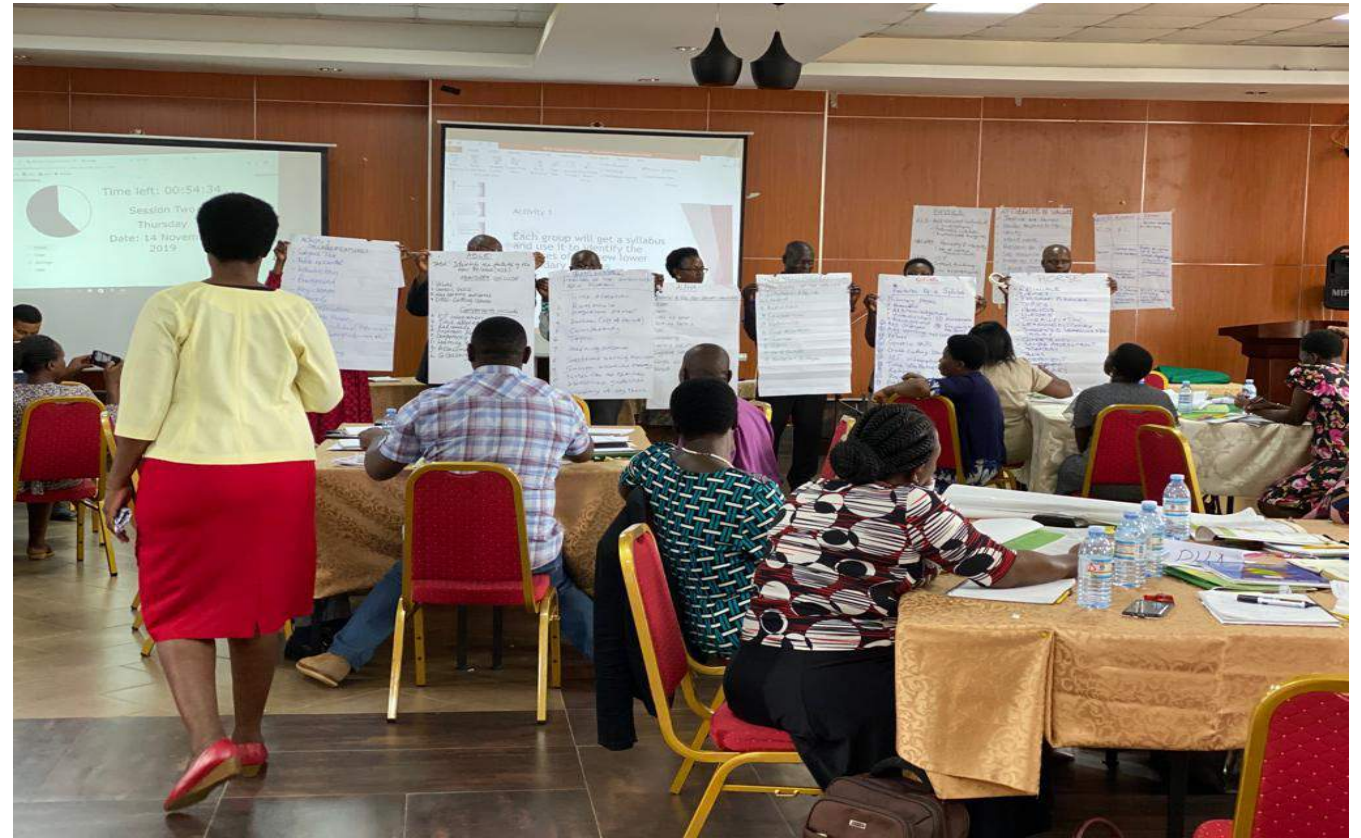
Photo: - A training workshop of 100 National Facilitators for the rollout of the revised O-Level Curriculum