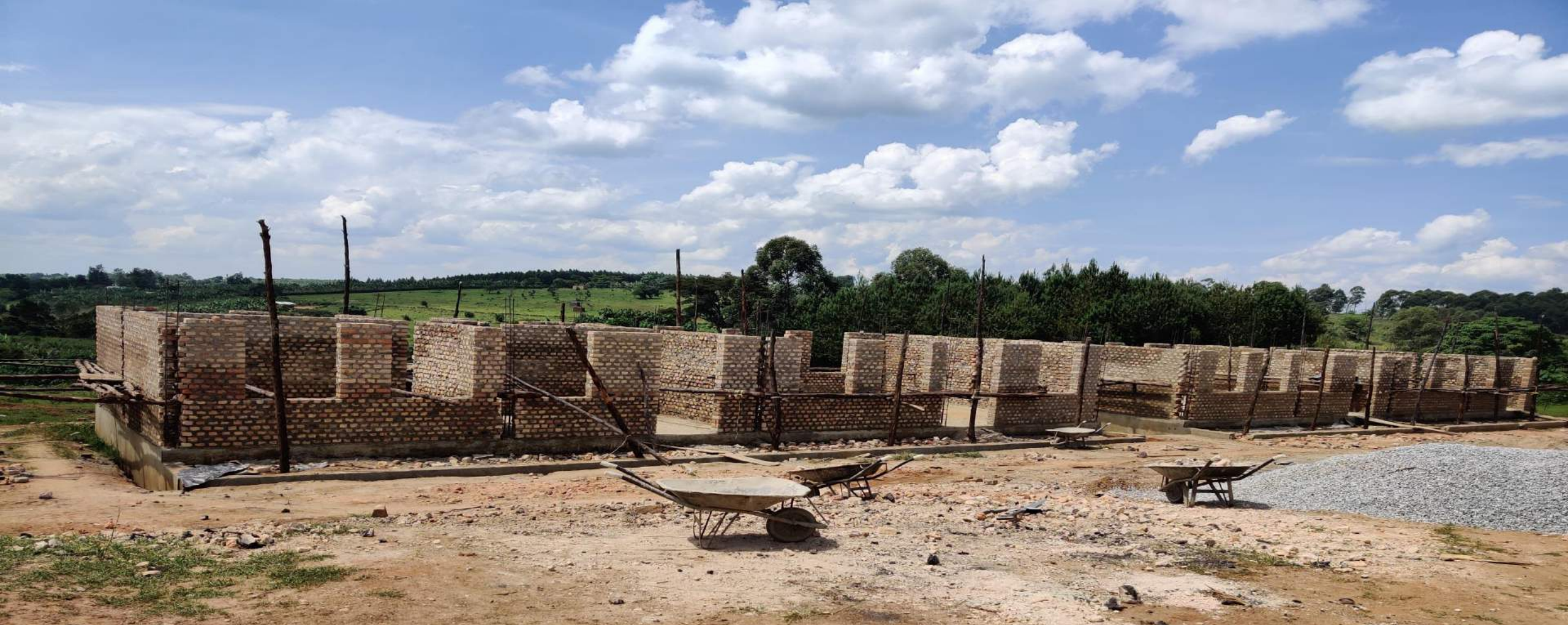
An Administration Block (R) and One 2-Classroom Block (L) being set up at Rwentuha Seed Secondary School in Kyegegegwa district – as part of the 117 Seed Schools