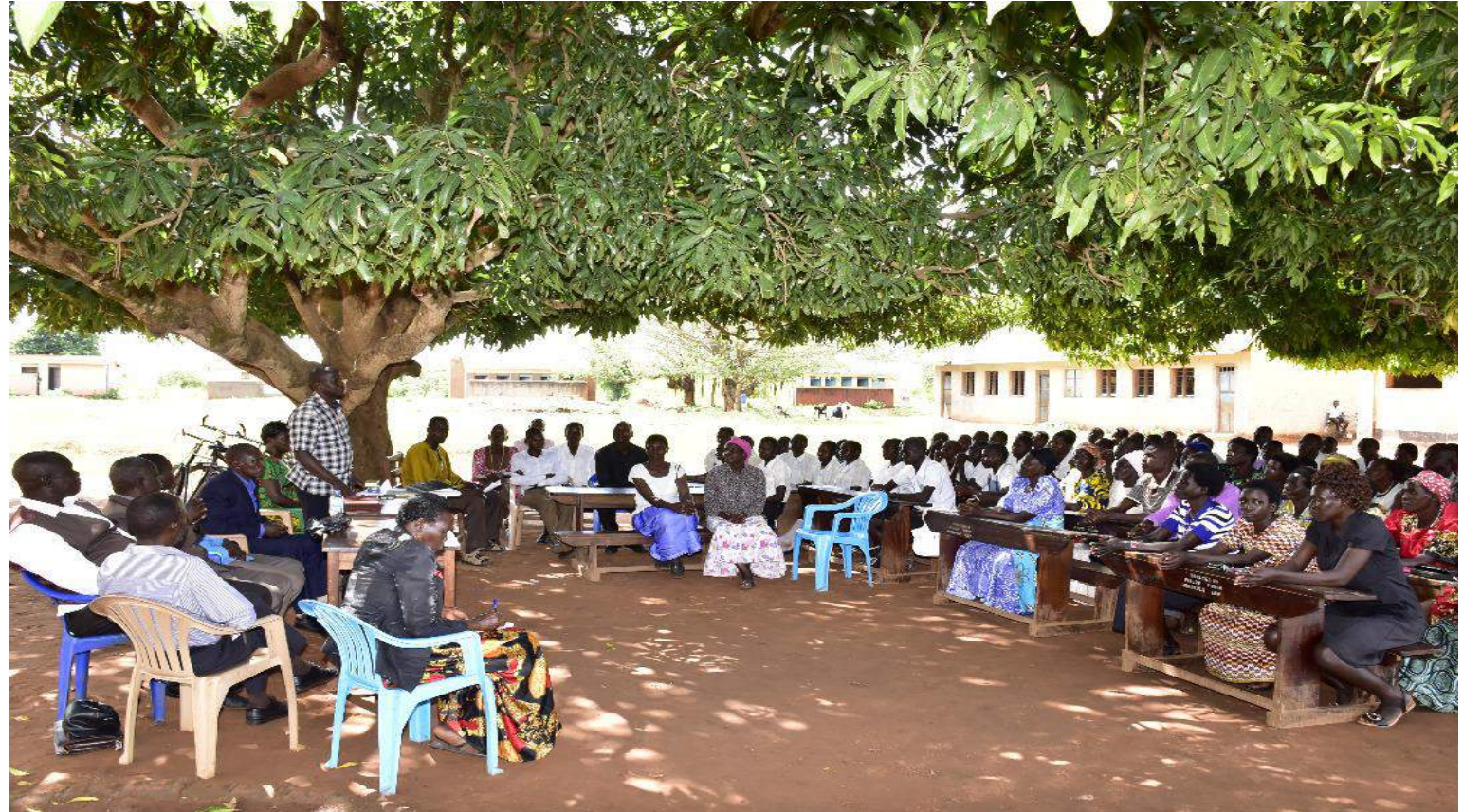
Photo (Dec. 2018): - A Parents' Meeting led by the School Management Committee at Apworocero P/Sch., Oyam District

Since July 2016, over 5,000 members of School Management Committees (SMCs) were trained about their roles and responsibilities in providing leadership in the Schools.