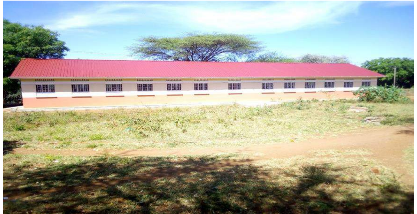
Photo: - The dormitory constructed at Moroto High School, Moroto