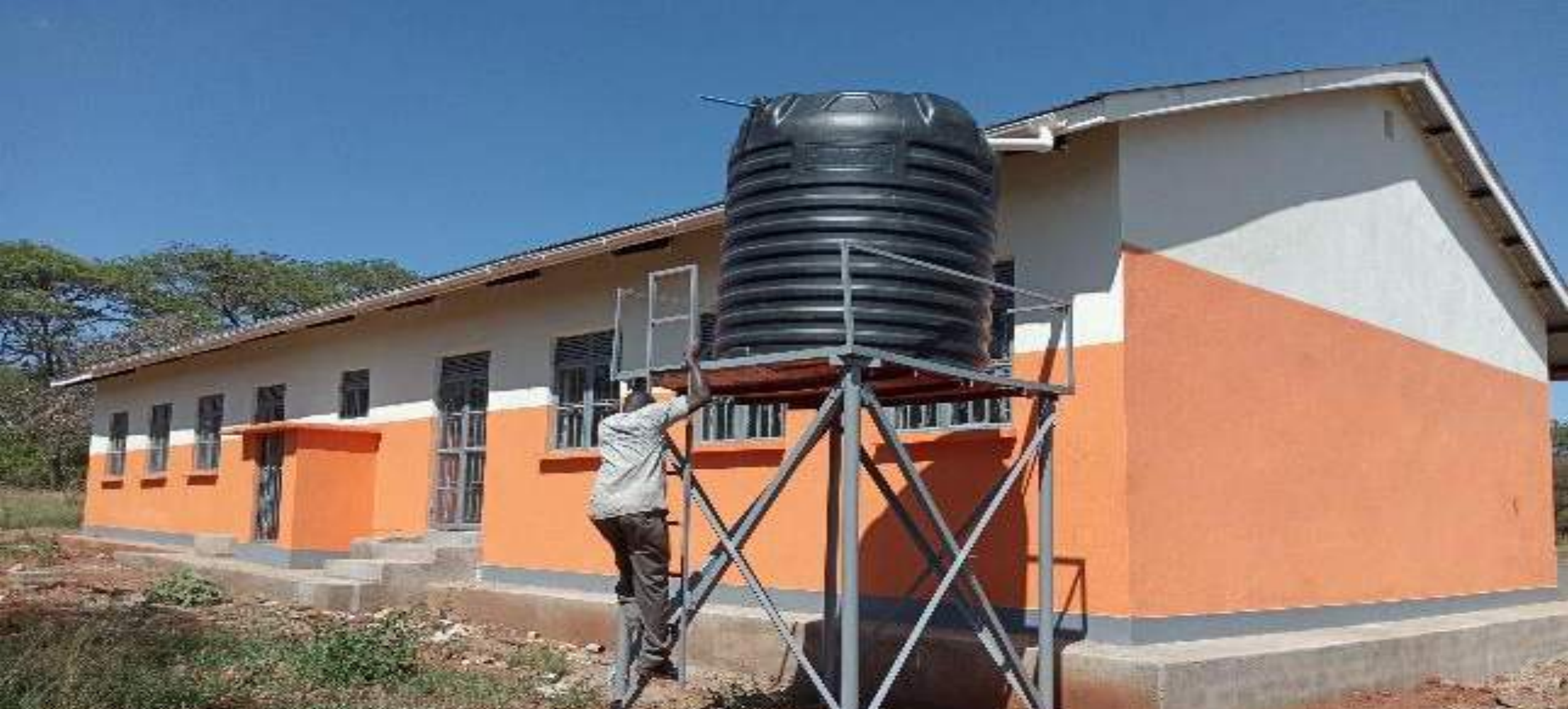
A Science Laboratory Block constructed at Ike Seed Secondary School, Kaabong district – as one of the 117 Seed Schools