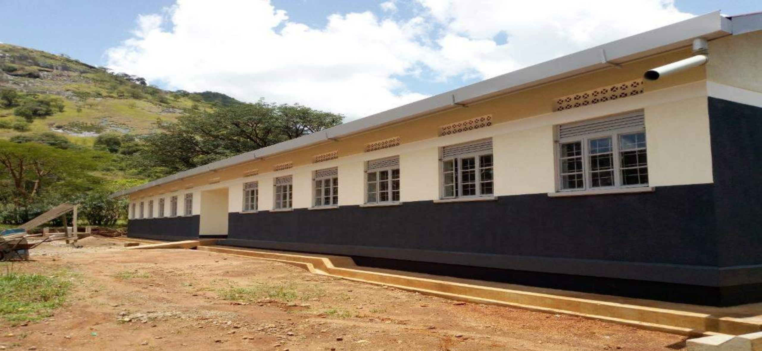
The dormitory constructed at Kiru Primary School, Abim under the Karamoja Education component in KIDP