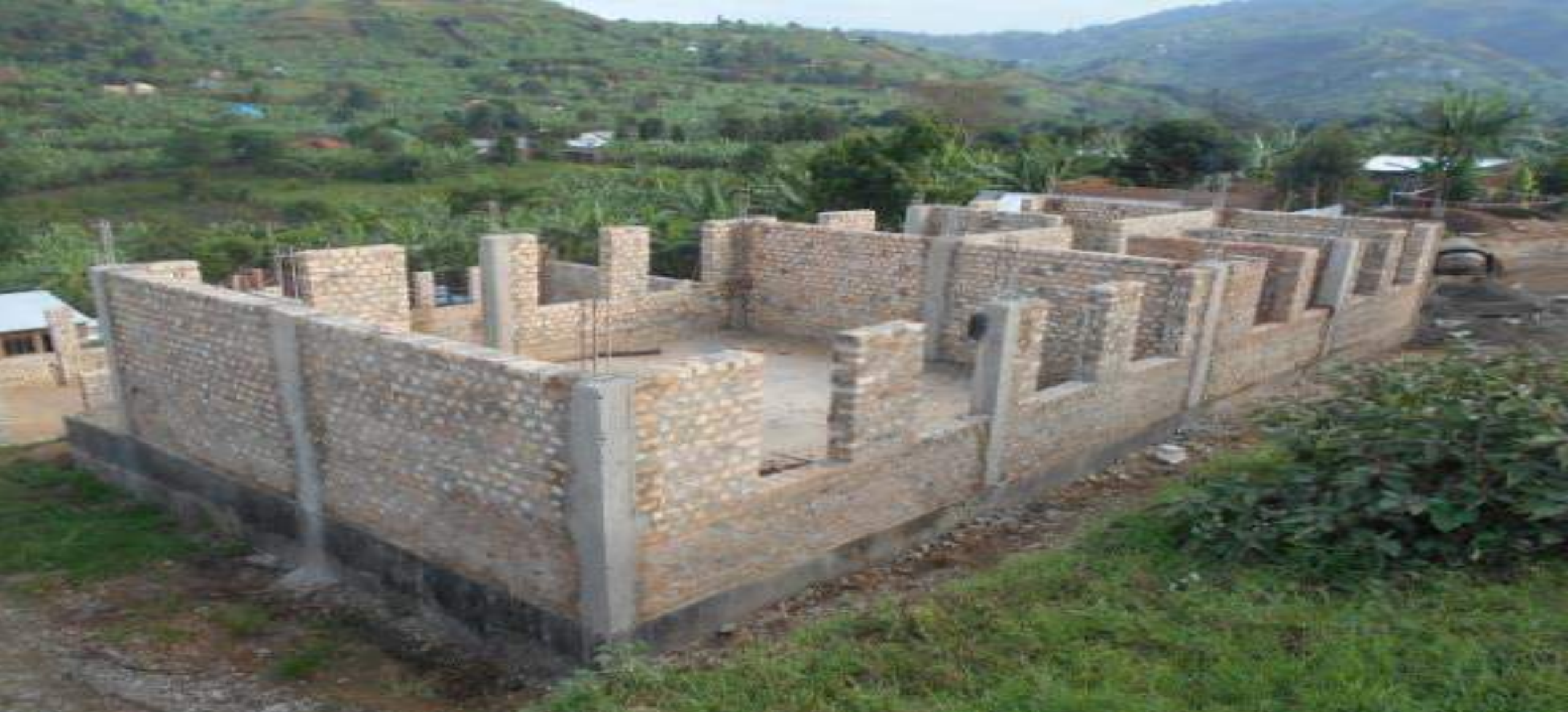
Classroom Blocks under Construction at Ryeru Seed School in Rubirizi District – as part of the of 117 Seed Secondary Schools