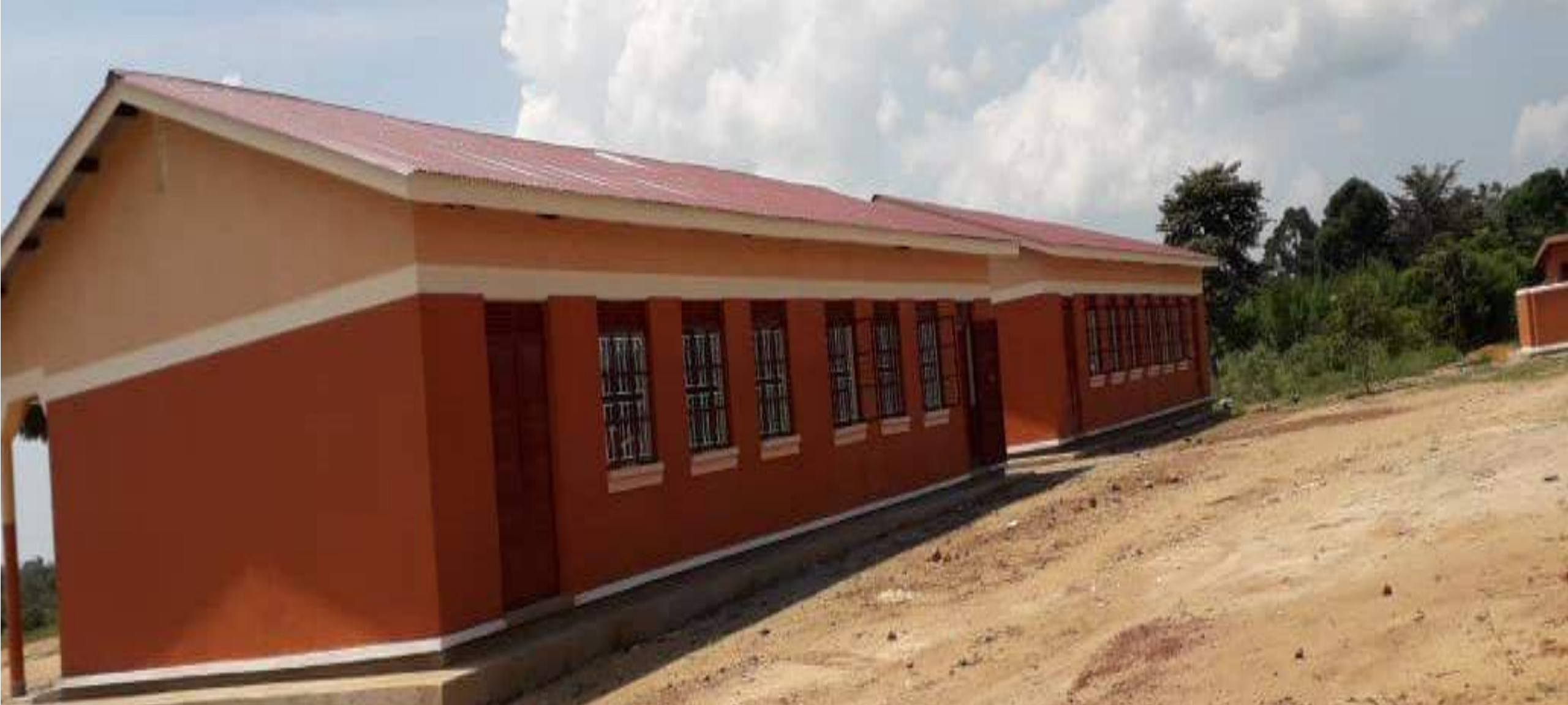
Two 2-Classroom Blocks constructed at Nairambi Seed School, Buvuma – part of the 15 completed