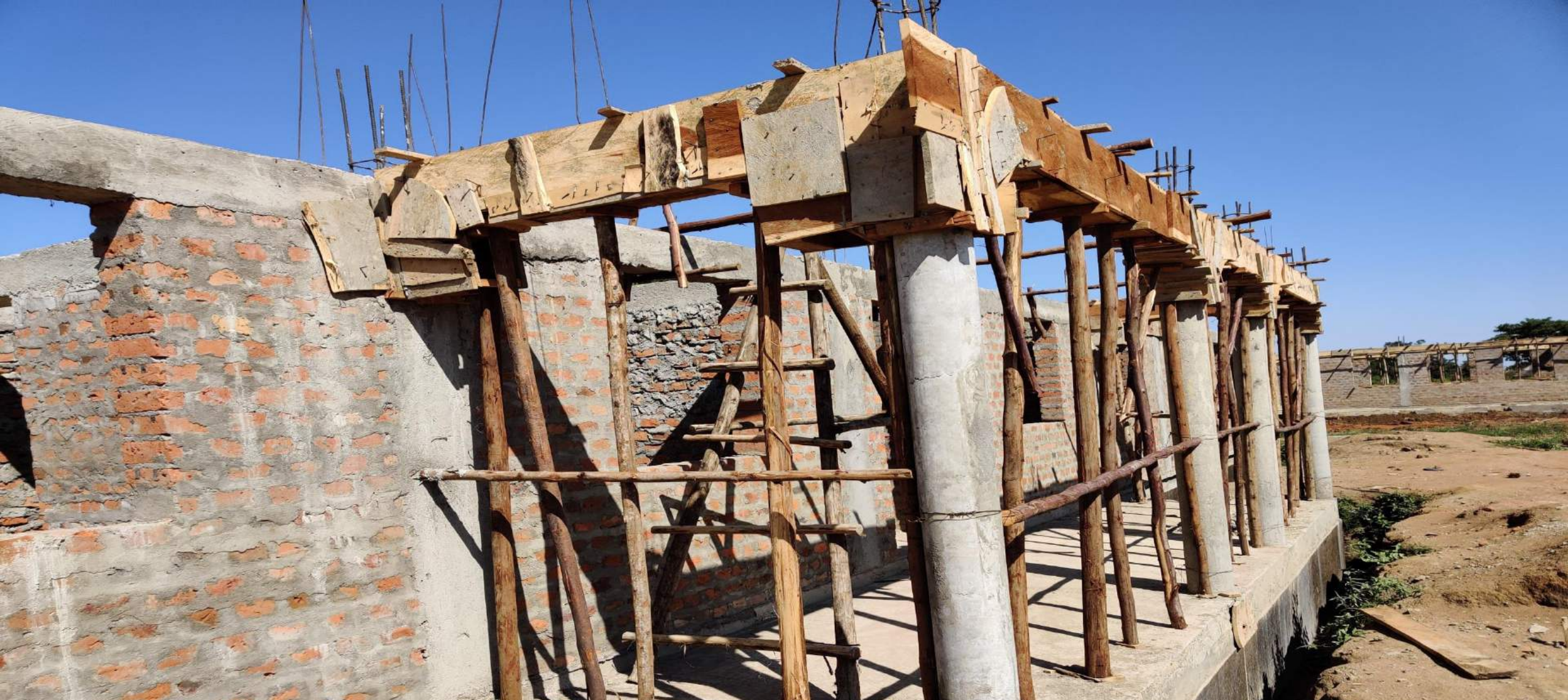
A Staff Housing Block under construction at Palam Seed Secondary School in Katakwi district – part of the 117 Seed School