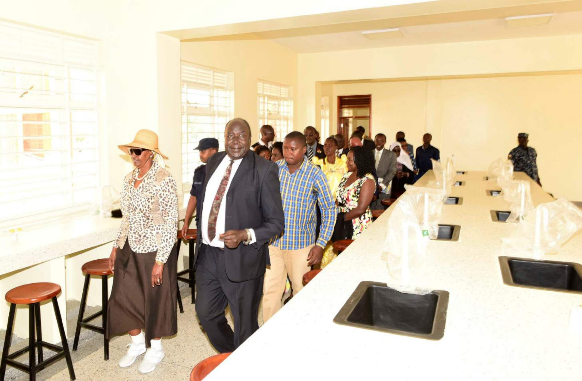
The First Lady/Minister of Education & Sports on a tour of the Science Laboratories at Soroti University ; accompanied by the Vice Chancellor.