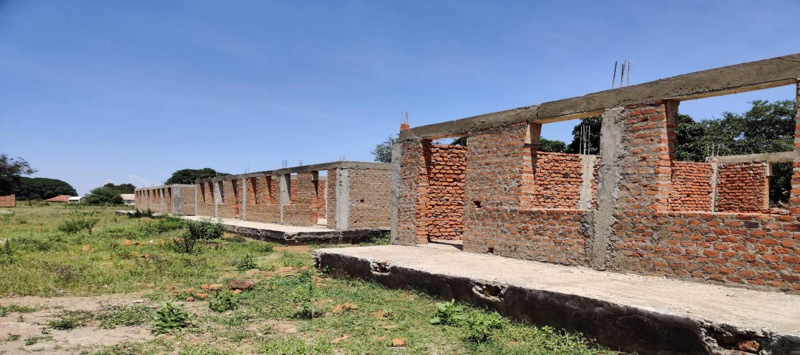
Three 2-Classrooms blocks set-up at Magara Seed Secondary School in Bukedea, district – as part of the 117 Schools