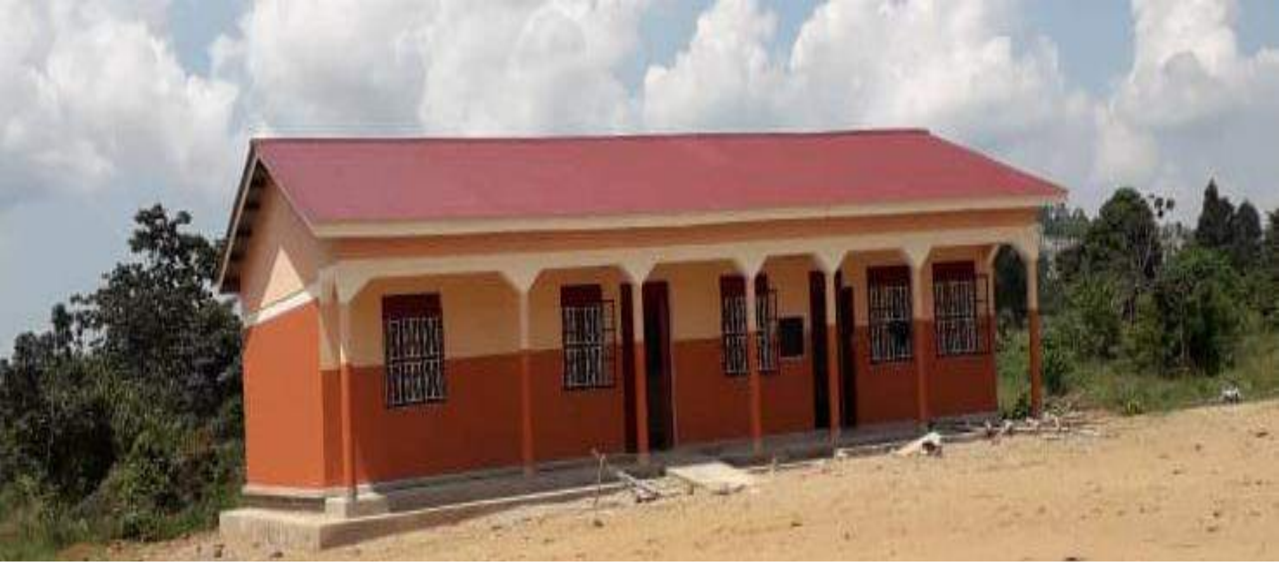
An Administration Block constructed at Nairambi Seed School, Buvuma – part of the 15 completed