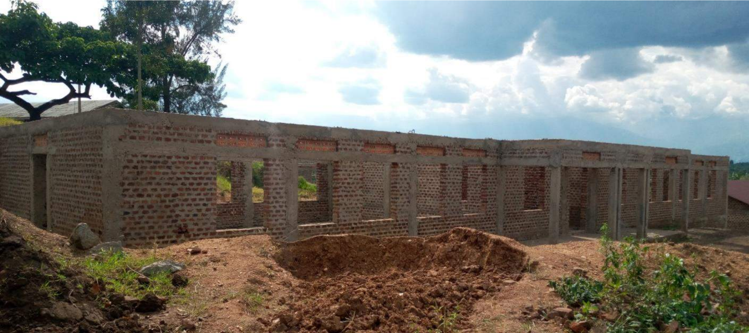
ICT Laboratory and Library Block being built at Kiyombya Seed Sec. School, Bunyangabu district – part of the 117 Seed Schools