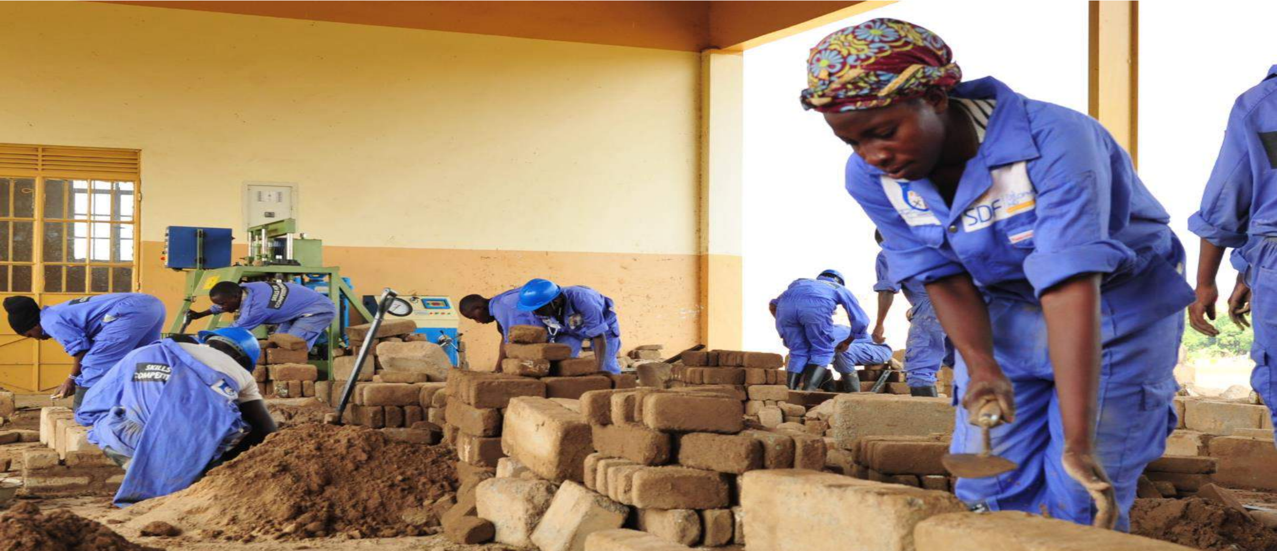
Students in a Building Workshop at Buhimba Technical Institute, Kikuube district. Buhimba is one of the 73 Technical Institutes