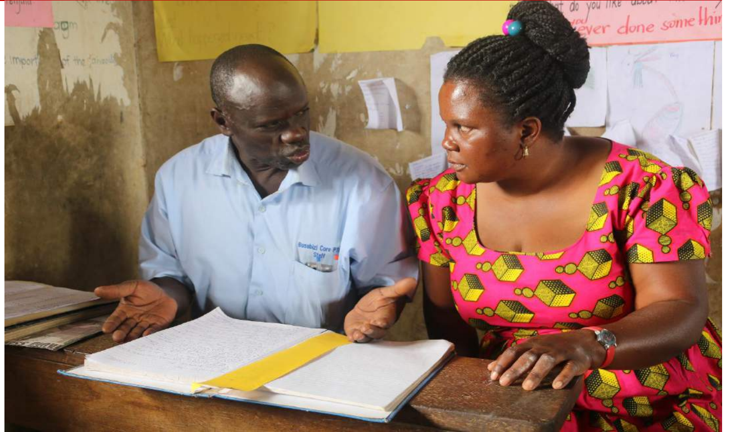
Photo: - a Tutor from Busubizi Core PTC offering In-Service training to a Primary School Teacher in Early Grade Reading.