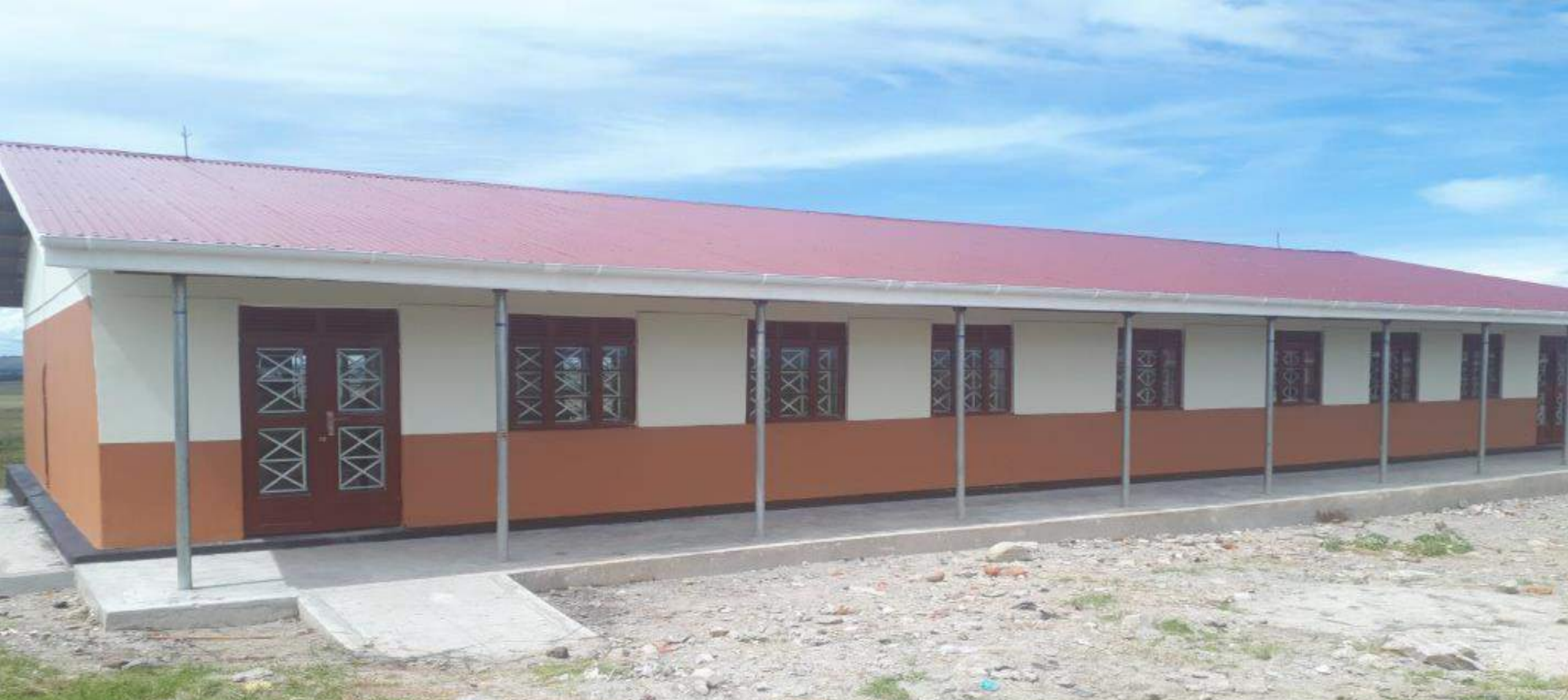
Science Laboratory Block constructed at Nyangoma Seed Sec. School, Kyotera district – part of the 117 Seed Schools