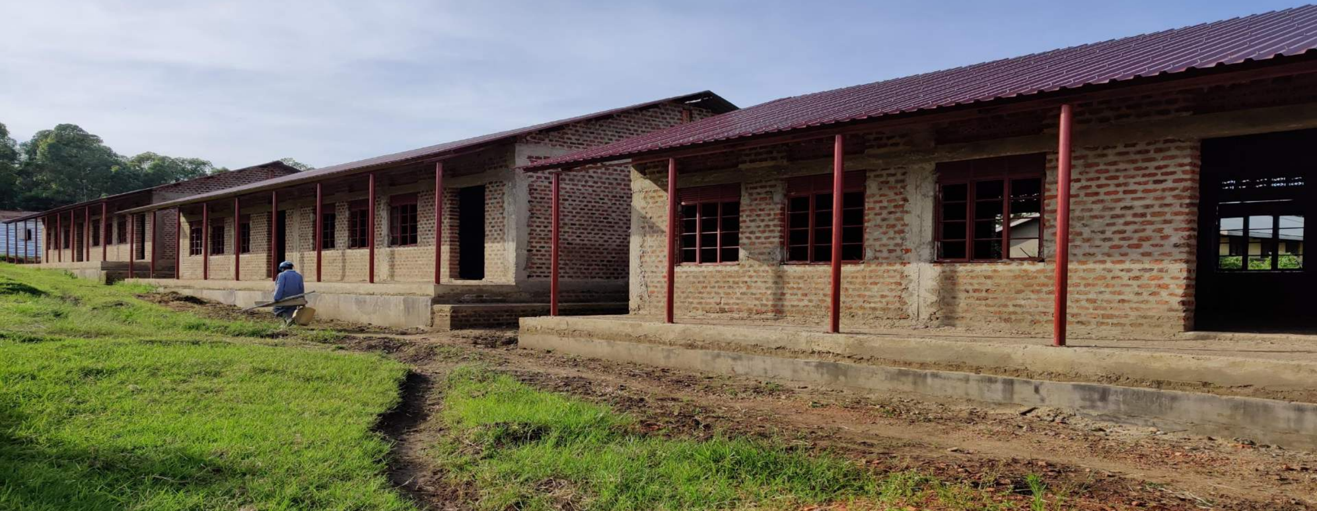
Three 2-Classrooms Blocks constructed at St. Paul's Nyabweya in Kabarole district – as part of the 117 Seed Schools