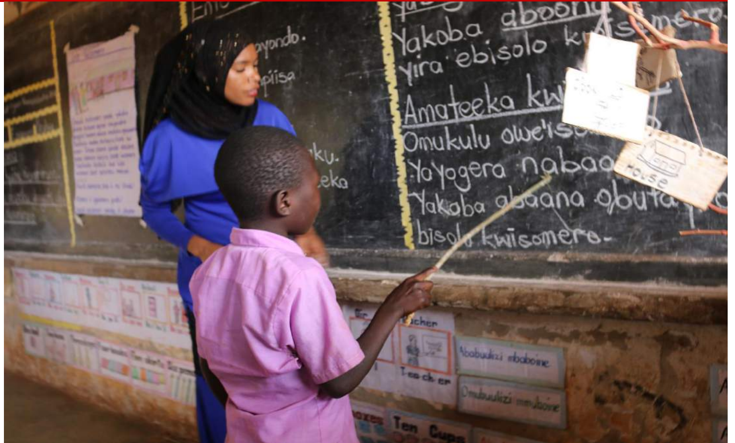
Photo: - a Pupil in a Local Language Class lesson as part of Early Grade Reading