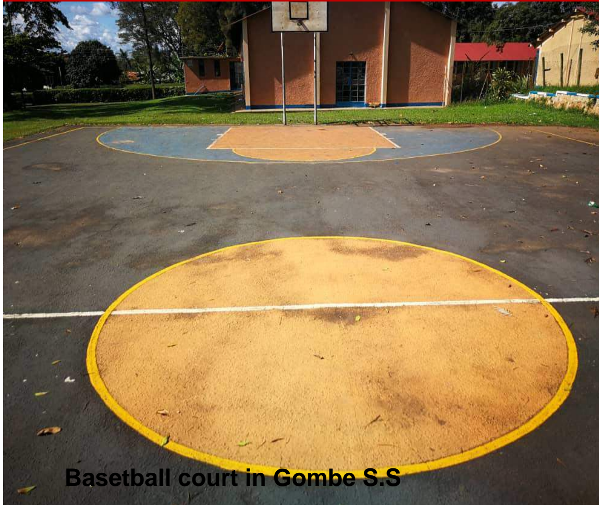
Basetball court in Gombe S.S